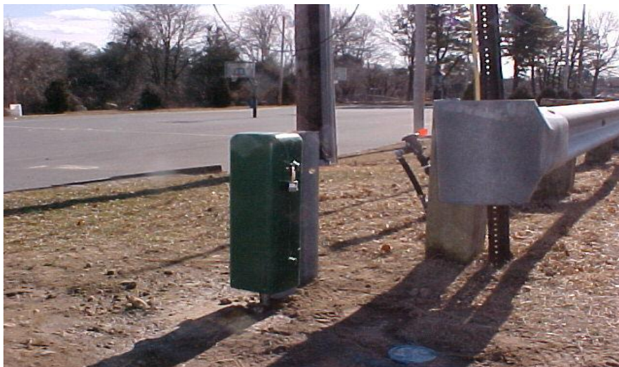
New-Dedicated Sampling Station - Marion Road

Radon is a radioactive gas that you cannot see, taste, or smell. Radon can move up through the ground and into a home through cracks in the foundation. Radon can build up to high levels in all types of homes. Radon can also be released from tap water when showering, washing dishes, or doing other household activities. Compared to radon entering the home through soil, radon from tap water will in most cases be a small source of radon in indoor air. Radon is a known human carcinogen. Breathing air-containing radon can lead to lung cancer. Drinking water containing radon may also cause increase risk of stomach cancer. If you are concerned about radon in your home, test the air in your home. Testing is inexpensive and easy. Fix your home if the level of radon in your air is 4 Pico curies per liter of air (pCi/l) or higher. There are simple ways to fix a radon problem that are not too costly. For additional information, call your State radon program or call EPA's Radon Hotline (800.SOS.RADON)